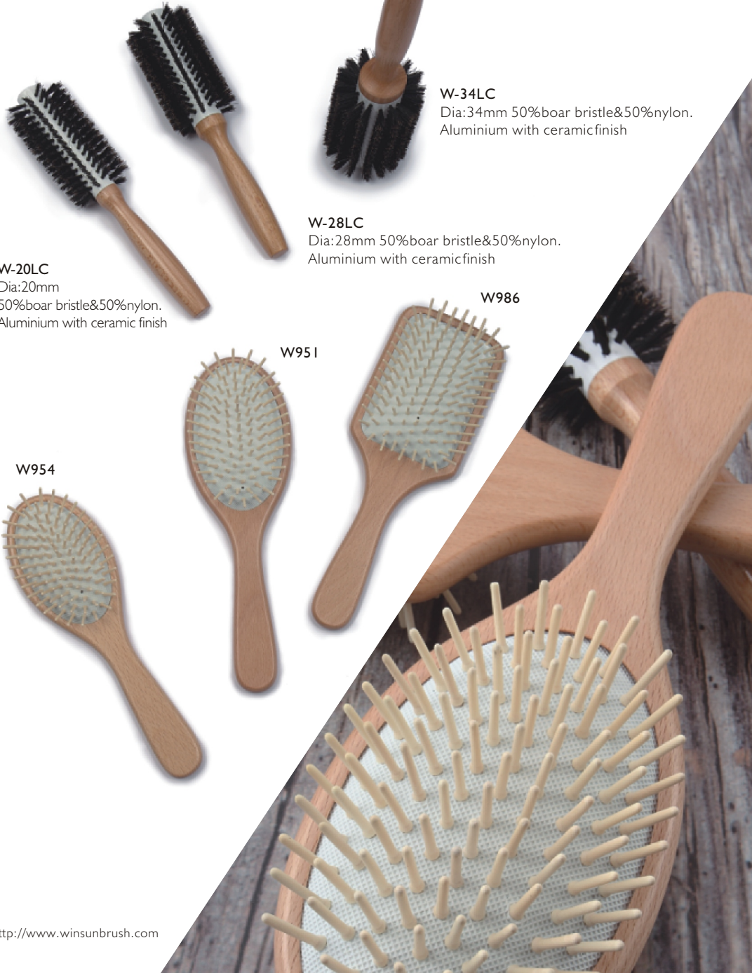
W-20LC Dia:20mm 50%boar bristle&50%nylon. Aluminium with ceramic finish